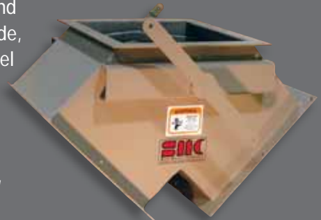
Manually operated Gates and Valves available.