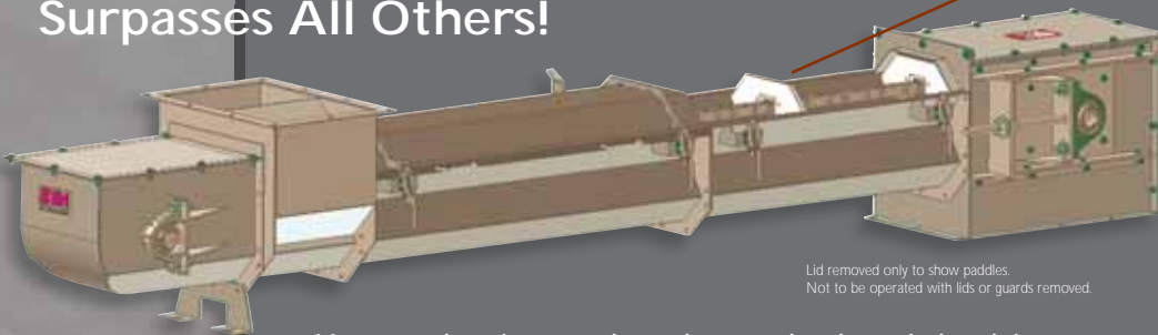
Lid removed only to show paddles. Not to be operated with lids or guards removed.